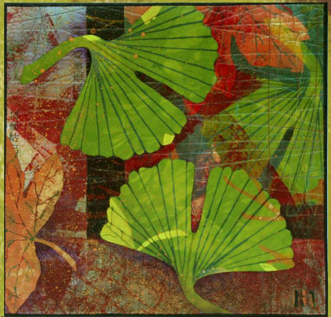
Autumn Song – Denise Oyama Miller

Deadline for entering via regular mail is September 12, 2013 to be included on the poster. Pay pal is available on the website.