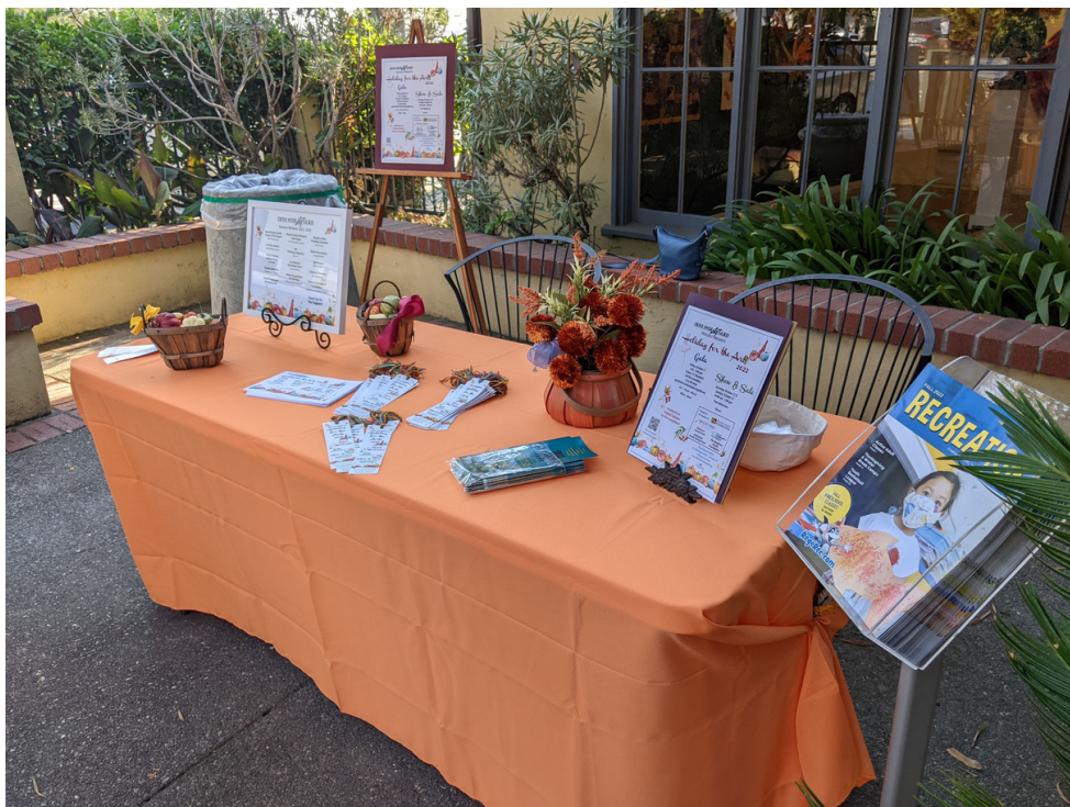
OHAG and COF Booth