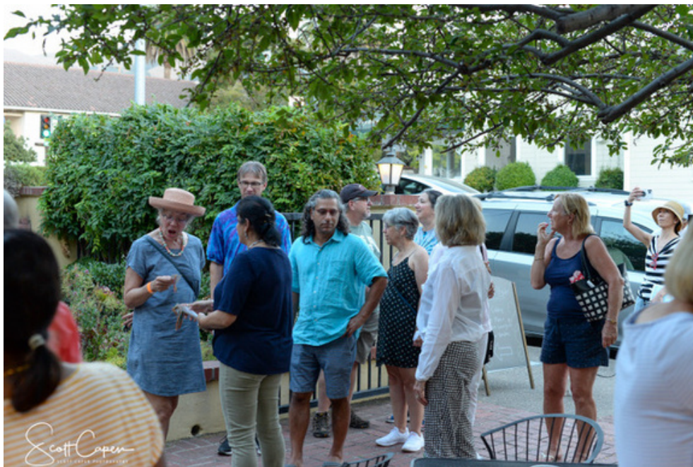
Revelers at OHAG!