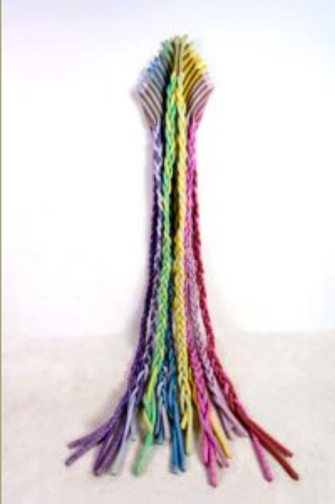
Inextricably Entwined III by Mona Duggan