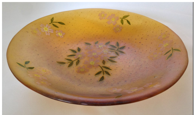
Cherry Blossoms in Spring by Emelie Rogers