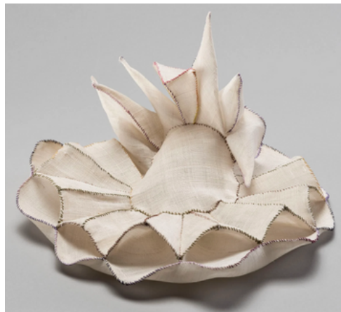
A Future Guest - Youngmi Angela Pak